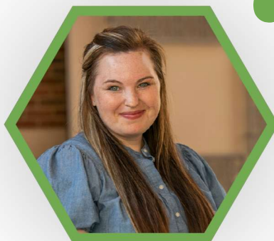
CHARLEY BROUGHTON DCPS Superintendent

We are grateful for a community that continues to invest in our students and support the work happening in our schools each day.